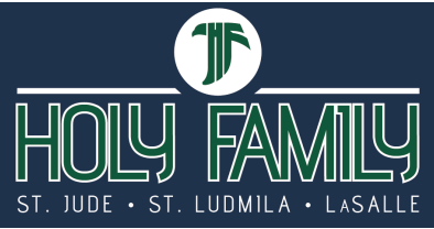
FULL FRONT - DESIGN B ON NAVY ONLY