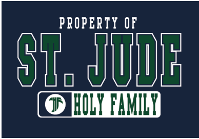
FULL FRONT - DESIGN A ON NAVY ONLY