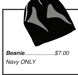
Beanie.....$7.00 Navy ONLY